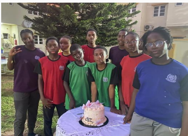
On Thursday, May 2nd, we marked the birthdays of those born in March or April with a delightful celebration featuring a beautiful and sumptuous cake.

The boarders enjoyed a trip to Domino's Pizza on Saturday, May 4, 2024. They participated in a pizza-making session, guided by the Domino's Pizza team, which was both fun-filled and educational. Each student received a certificate of participation, acknowledging their newfound pizza-making skills.